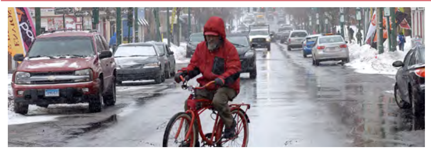
The project's Bicycle, Pedestrian, and Transit Working Group is exploring methods to improve bicycle, pedestrian, and transit connectivity in conjunction with the redesign and reconstruction of I-84.

When we think of I-84 today, we think of cars and trucks. The concept of a highway is deeply ingrained.