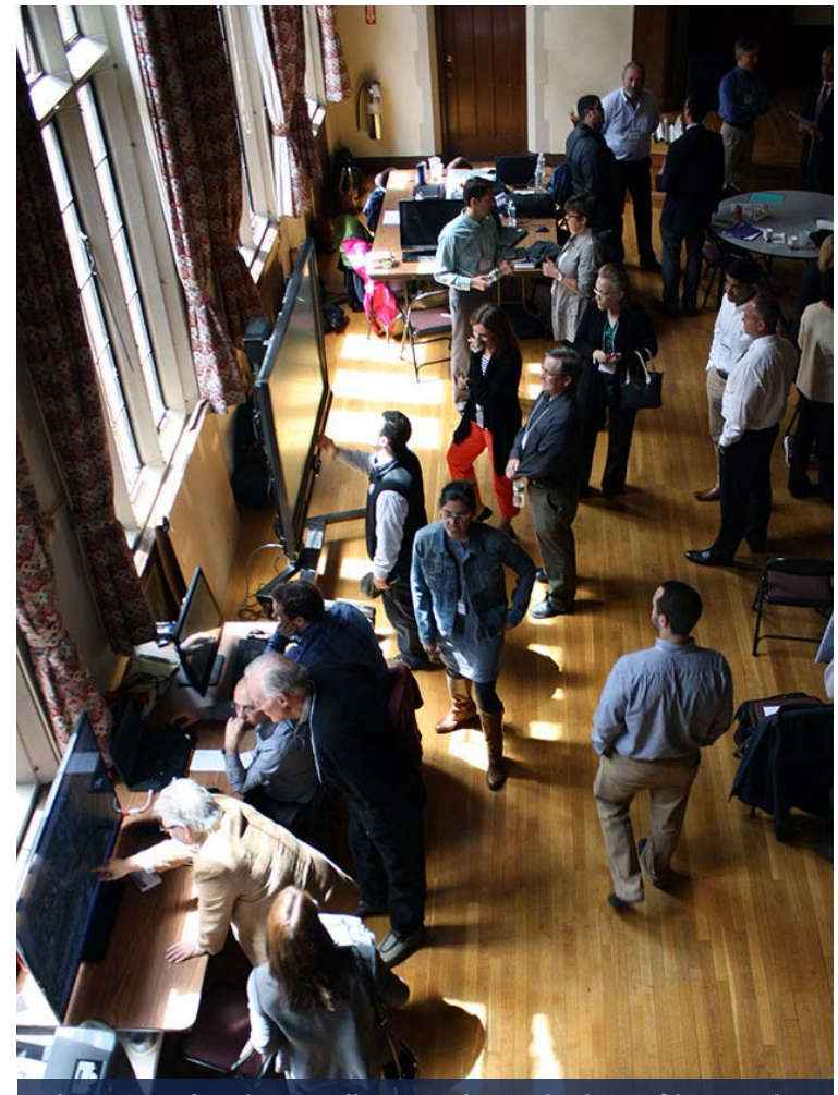
The Open Planning Studio was a busy six days of interactive programming, targeted stakeholder meetings, working sessions, and an ongoing open house.