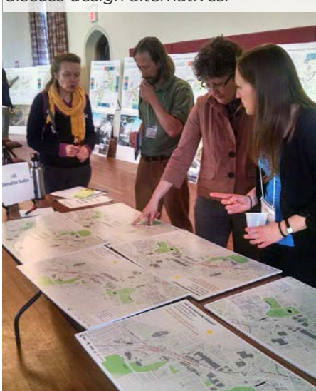
Open Planning Studio visitors discuss design alternatives.