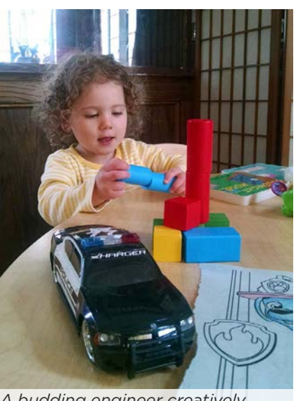
A budding engineer creatively explores bridge design.